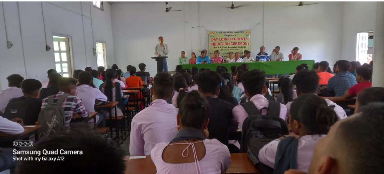
©©©© Samsung Quad Camera Shot with my Galaxy A12